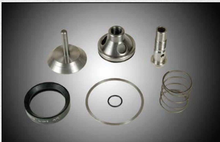
Check Valve Parts