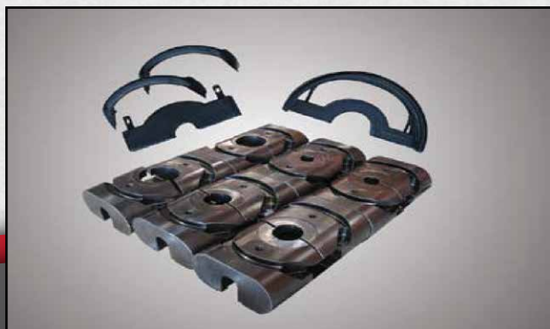
Rams and Elastomers