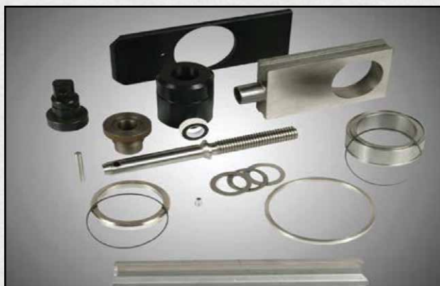
Manual Gate Valve Parts