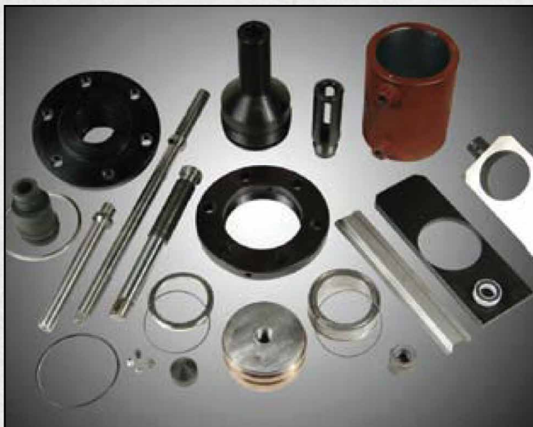
Hydraulic Gate Valve Parts