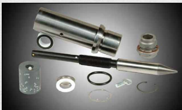
Adjustable Choke Parts

Total Oilfield replacement parts inventory includes parts and accessories for a wide range of pressure control equipment. With our vast network of suppliers, the part you need is close at hand. Let us do the legwork for you.